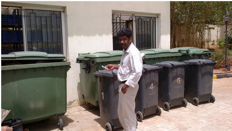
One of the Apartment collecting the segregated waste and installed Organic convertor and sorting facility