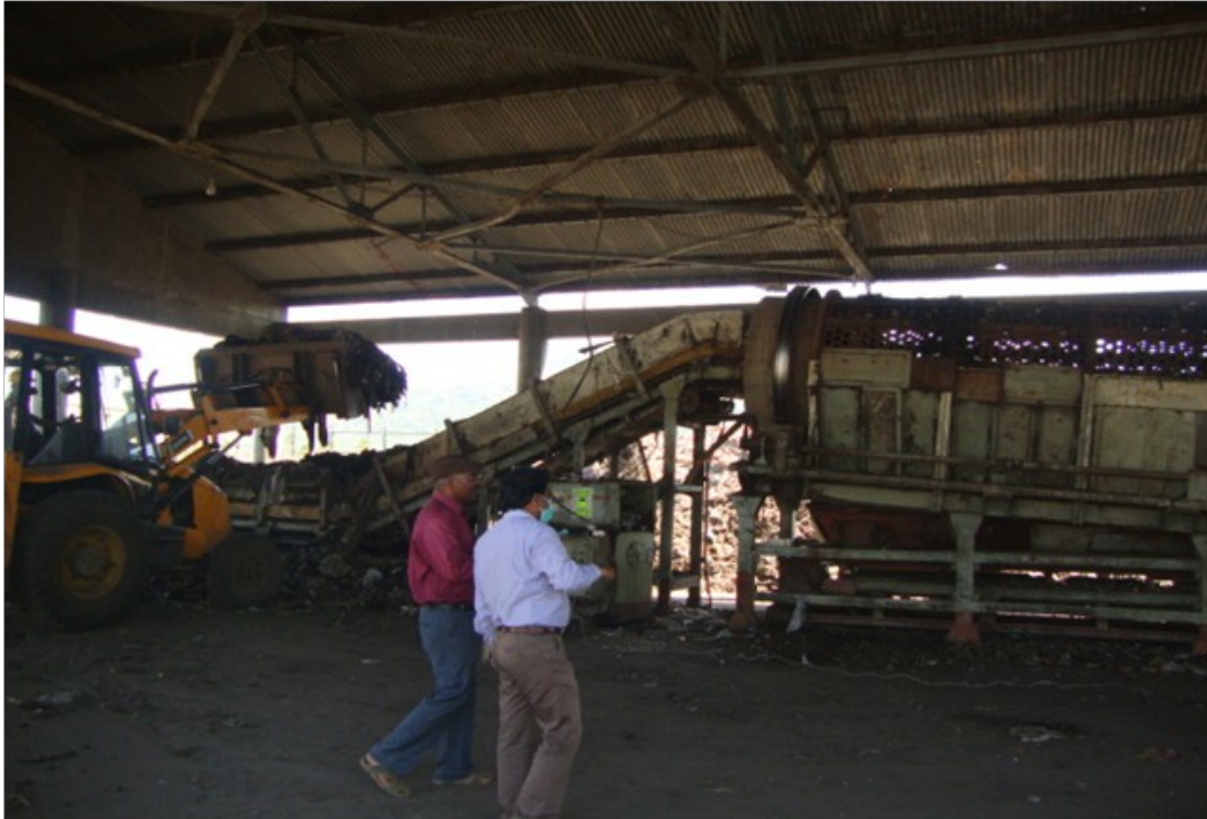
MCC Compost Plant at Vidyaranyapuram operated by IL&FS