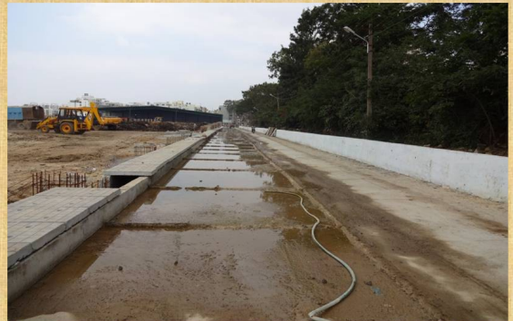
500 TPD ISWM PLANT KCDC