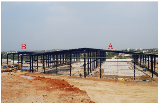
Lingadheeranahalli on 7.1.2015

Processing Sites in Bengaluru being developed within the core area