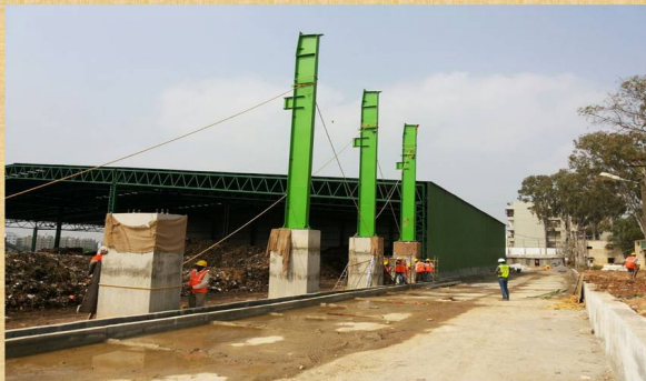
500 TPD ISWM PLANT KCDC