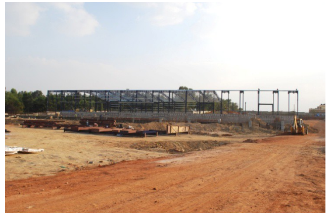
Doddabidrakallu on 7.1.2015