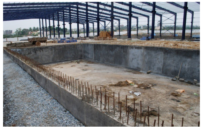
Lingadheeranahalli on 7.1.2015 A