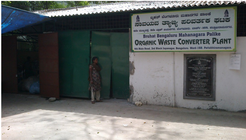
One of the Dry waste collection centre in Bengaluru