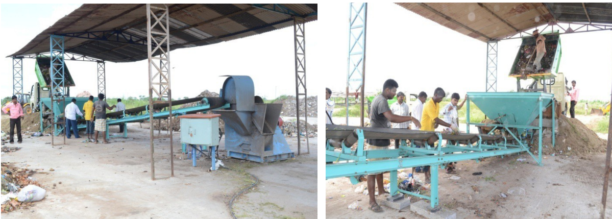
Koppal Model of Composting Machine installed at CMC, Koppal