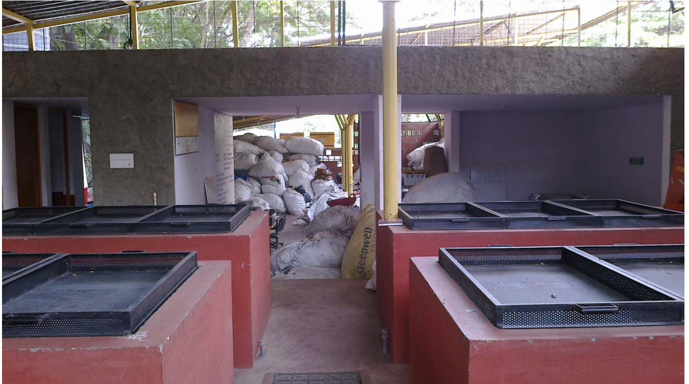
Vermicomposting and Dry Waste collection Center at Koramangala Ward at BBMP, Bengaluru