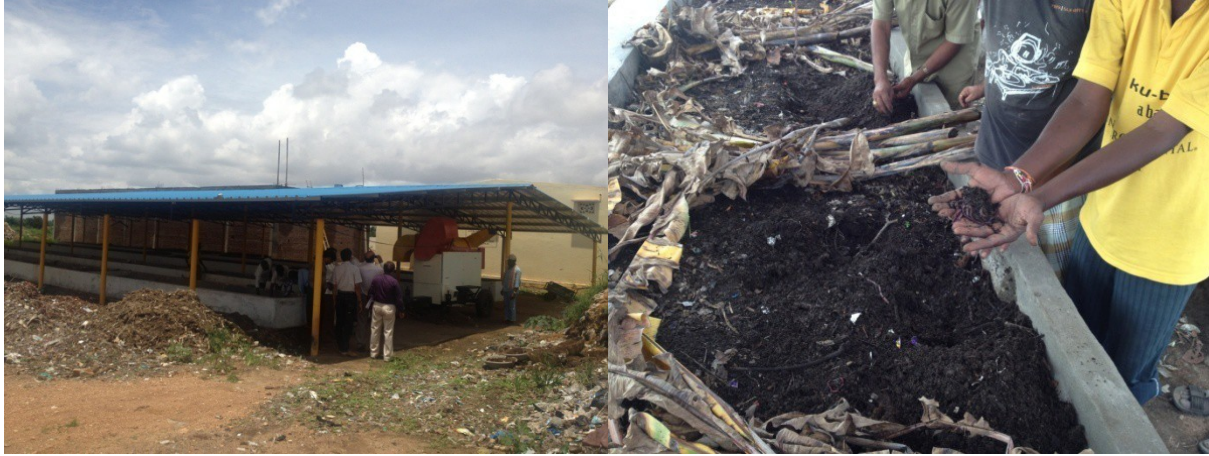
Waste vermicomposted at Sira, TMC