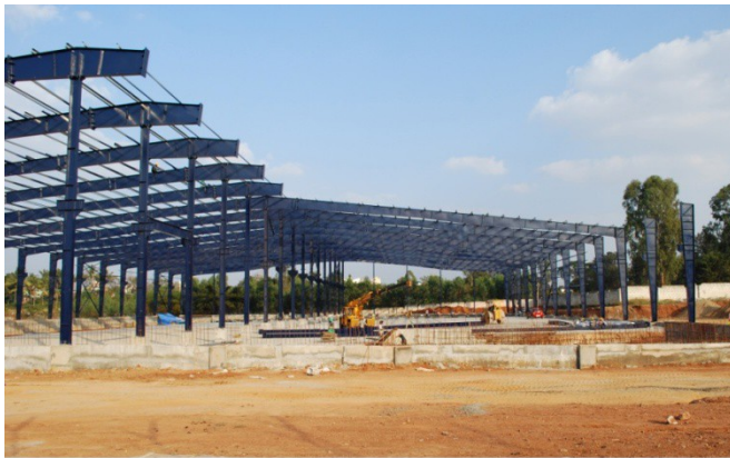
Doddabidrakallu on 7.1.2015